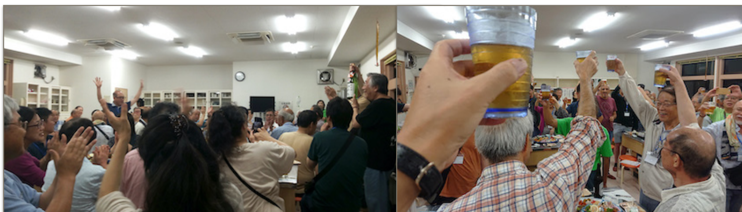
Sake sponsor found, Kampai!

Aside from the hard learning and studying and the serious commitment to shakuhachi everyone present was showing, the later in the evening gatherings were the place where the serious fun was to be found: Kampai! or “to empty your glass” was clearly the connecting thread in late evening entertainment. Each bottle of sake, brought by participants from all over Japan, was formerly introduced and “arigato’s” were given to the generous provider.