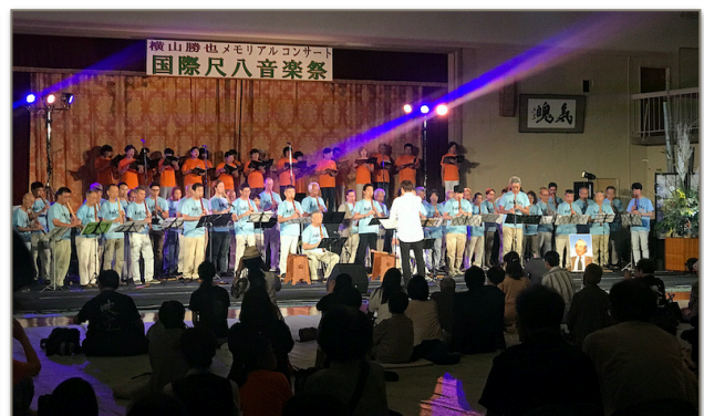
Futatsu-no Oshushi performance (EK)

Besides we had opportunity to join into group performances of San'ya (Mountain Valley) on 2.4 shakuhachi as well as a glacial and moody rendition of Tamuke supported by a front row of the main Kenshūkan personnel playing the super wide giant 3.6(!) shakuhachi (one octave lower than 1.8). And, I suppose, no Kenshūkan celebration is complete without a forceful outing of the group 'classic' Goru composed by Yokoyama.