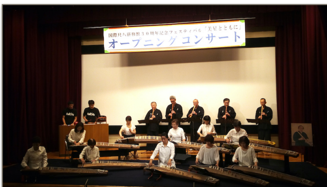
Performance of Minori-no Aki (TK)

The group pieces are a great element of the celebrations and I feel, capture the communal spirit of the festival very well. Everybody is invited to be part of the performance and indeed only the multitude of shakuhachi can bring these pieces to proper fruition and make them alive. To me it was one of the highlights of being at the festival to take part in the group pieces.