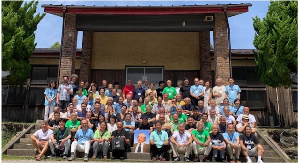
Participants and Teachers, Bisei 2019