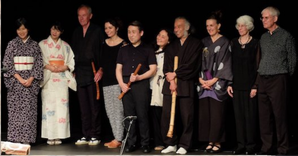
ESS Lisbon 2019, teachers' concerts, students' concert