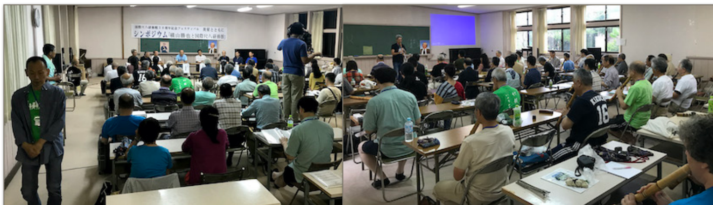
Symposium and Workshop classes in Bisei (EK)

The main workshop and classes were focused on the classic honkyoku repertoire as taught and transmitted by Yokoyama. Pieces explored were San’ya (Mountain Valley), Shingetsu and Sagariha. Of course ample time was dedicated to the study and rehearsals of the aforementioned group pieces Futatsu-no Oshushi (Doi), Eien-no Tabibito (Molina) as well as Goru (Yokoyama).