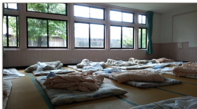
One of the communal sleeping rooms (TK)