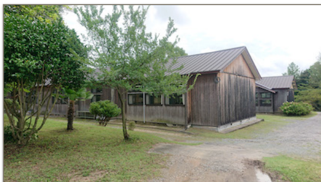
Hoshino-Sato Fureai Center (ST)

I don't have proof but possibly there was always a Tamuke played somewhere sometime.