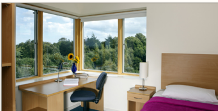
(UCD on-campus accommodation)

We have secured a special discount for UCD on-campus accommodation. The quality of the rooms and the facilities are excellent, compete well with Dublin hotel prices and offer easy access to the summer school venue. It will be possible to book for either 5 or 6 nights. Please note that accommodation booking needs to be made before or on January 19, 2020. There are a limited number of rooms so early booking is advised.